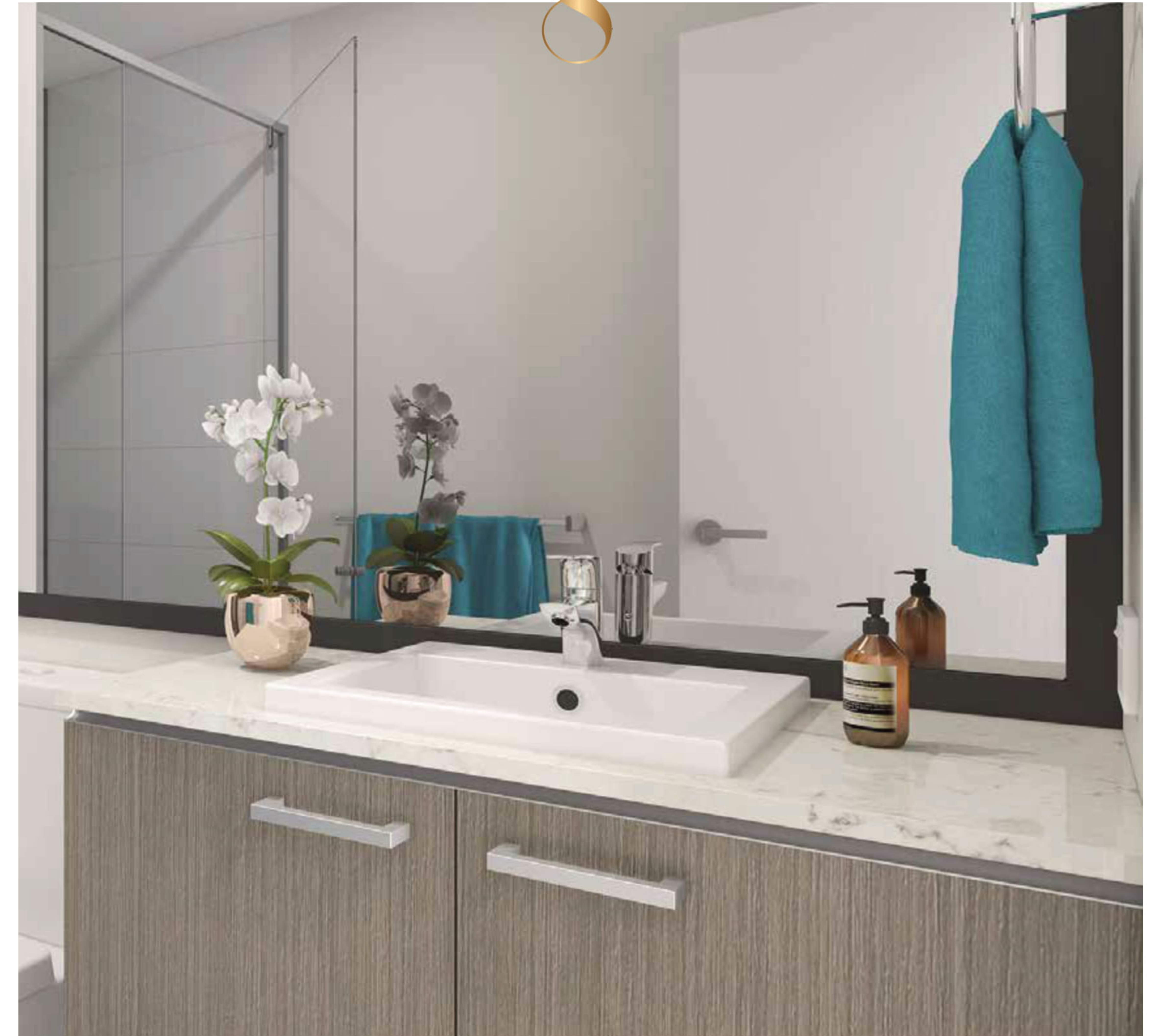
The detail is even more extraordinary. Polished bathrooms and ensuites feature stone vanity bench tops, creating the perfect place to refresh and renew.