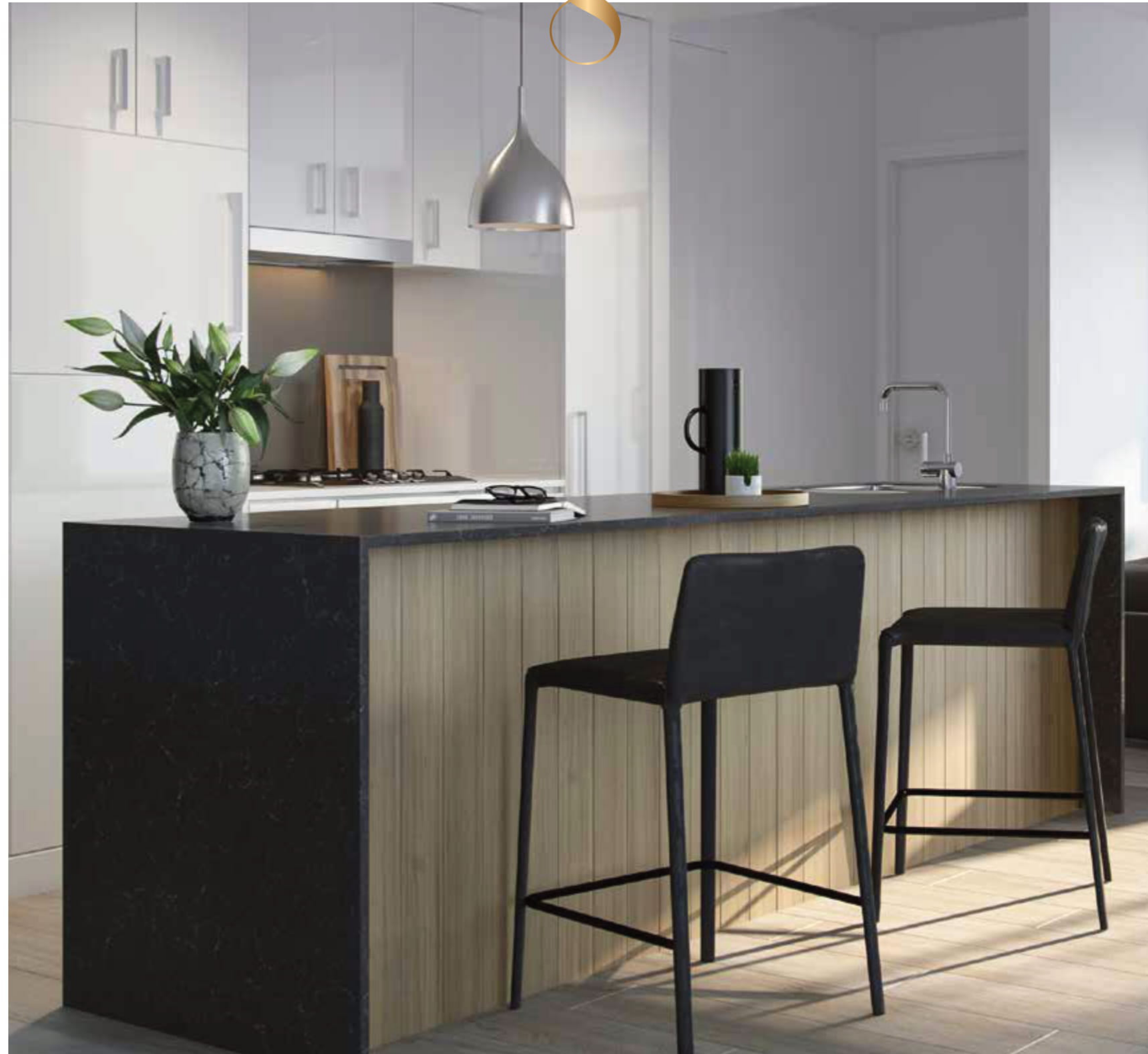
Designer kitchens, featuring waterfall-edged stone bench tops, are graced by exceptional fixtures and fittings.