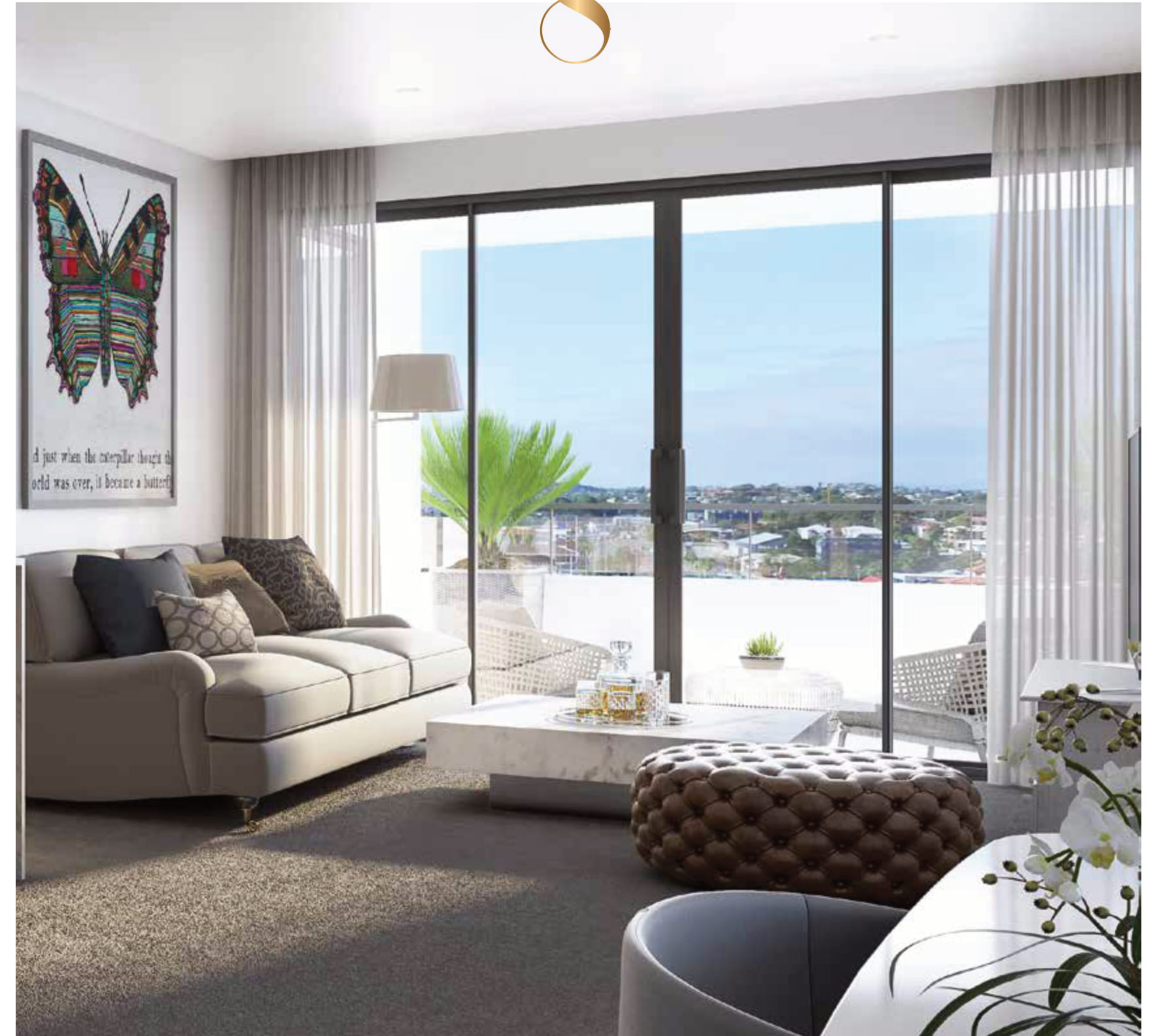
Superior finishes compliment expansive balconies that flow seamlessly from spacious living and dining areas.