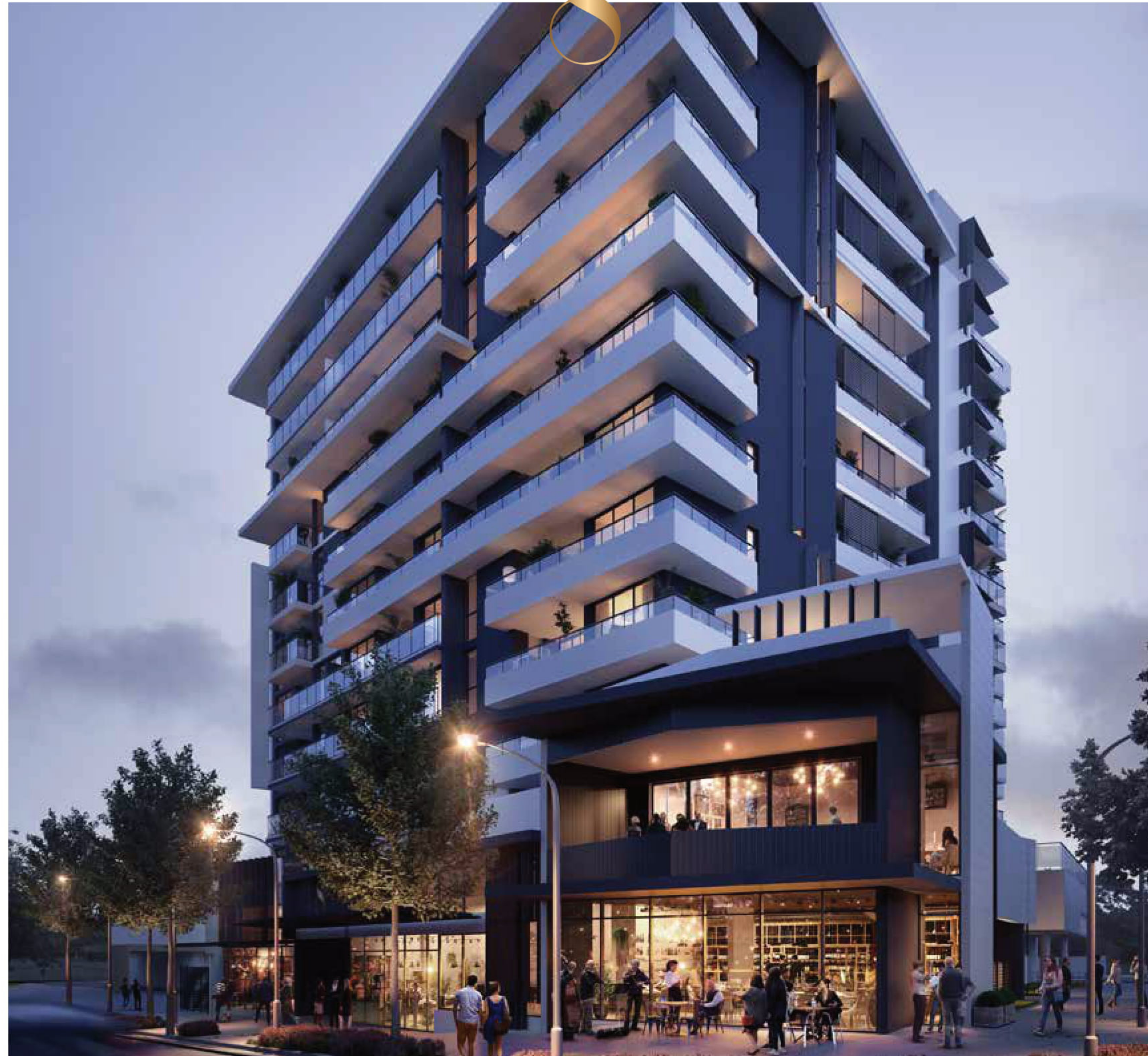
The big picture is impressive. Residences sit elegantly above a ground floor and mezzanine retail level and on-site manager's apartment and office.